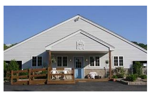
Second Chance Adoption Center East Brookfield, MA

The dogs are in the program for approximately 4 to 8 weeks depending on the need of the dog. The intensive curriculum is 24/7 with the dogs living with their handlers in the housing unit. This is all important in training the dogs and helping with their socialization.