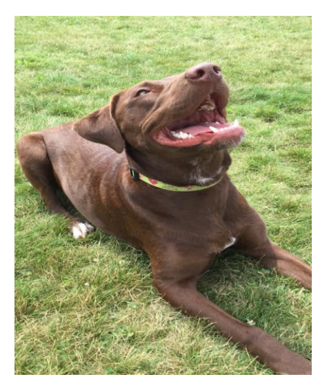
Willow is a Project Good Dog Graduate