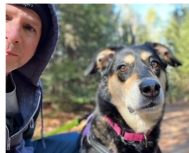
Roxie was still waiting to find her home at the time of publication.

One day hopefully soon Roxie will go home. It's going to break my heart to see her go...and I am thankful for that.