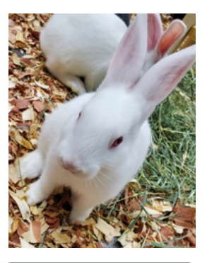
Over 20,370 pets have found forever homes.

Over 288,000 pets have been helped through our veterinary hospitals, pet food pantry, and all the programs that help keep pets in their homes with the families who love them.