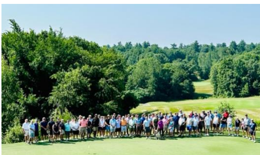
2024 Second Chance Golf Tournament

For many veterans, the bond with their pets is a vital source of comfort and emotional strength. Project Keep Me ensures they don't have to make the heartbreaking choice between seeking life-saving treatment and ensuring their pet's safety. This life-changing program is entirely funded by generous donors and reflects Second Chance's commitment to keeping pets and their people together during life's most challenging times. With your continued support, we can provide a lifeline for more pets and their owners when they need each other most.