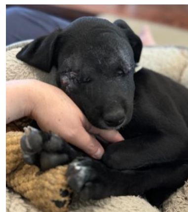
Immediately after losing his sight, Ribbet found comfort from the gentle touch of caregivers.

Our veterinary team immediately performed life-saving surgery to stabilize Ribbet. Though he lost both eyes, their efforts ensured he had a chance to heal. His recovery was a testament to his incredible resilience and the dedication of those who rallied around him. Thanks to the love and expertise of all his caregivers, Ribbet is adapting to his new reality with remarkable courage, learning to navigate his surroundings and even discovering a newfound joy: playing fetch with a jingle ball.