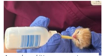
A newborn kitten nurses at our Springfield Hospital after the owner brought mom to us for an emergency c-section that saved both their lives.

By offering affordable services, we're breaking down barriers to veterinary care and helping families avoid the heartbreak of giving up a beloved pet. Every one of those 38,213 pets represents a story of hope and healing. For families struggling to make ends meet, our hospitals provide more than medical care—they offer peace of mind. With a focus on addressing the root causes that often lead to pet surrenders, our hospitals are not only transforming individual lives but also strengthening the bond between pets and their people. Together, we're making a lasting impact, one pet at a time.