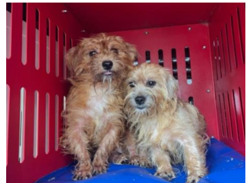
The support of Monthly PetPal Champions allowed us to say YES to 27 local pets in crisis. Today, they are all in loving homes.

Support Everyday Care: From spay/neuter surgeries to daily meals, your recurring gift keeps our operations running smoothly, providing essential care for pets who depend on us.