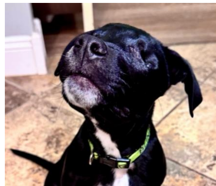
Meet Ribbet: A Young Puppy's Journey of Resilience and Love – Read His Story Inside!