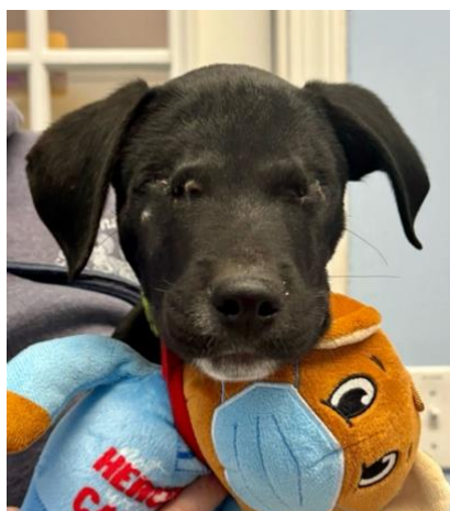
Update from his new family: He is such a special little guy and we love him so much. He slept a lot last week and it feels like he grew overnight! He's getting so big already.

Thousands followed Ribbet's journey on social media, captivated by his strength and transformation. When he was finally cleared for adoption, his foster family could officially welcome him into the family. Today, Ribbet is thriving in his forever home, a happy and playful puppy surrounded by love.