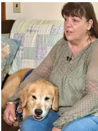
BoSox is more than a service dog. He's her best friend. She's gone without food to feed him, but thanks to our pet food pantry, they both get the nourishment they need.

As more families face financial hardship, many are making heartbreaking choices to keep their pets fed by skipping their own meals, forgoing medications, or ultimately surrendering beloved companions when they can no longer afford pet food. At Second Chance, we're committed to addressing this hidden crisis. By providing pet food to local human food pantries, we're making it easier for families to access pet food where they're already seeking help for themselves, removing barriers and helping pets stay where they belong: at home.