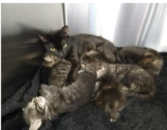
Delta arrived with her seven kittens. This family is living with one of our amazing fosters until they are old enough for adoption.

Last month, we took in 52 cats from one overwhelmed home - a massive rescue made possible by the support of our community. The cats ranged from a mom and her kittens to dozens of affectionate adult cats. Many greeted staff with purrs and head-butts, a testament to their sweet and social nature.